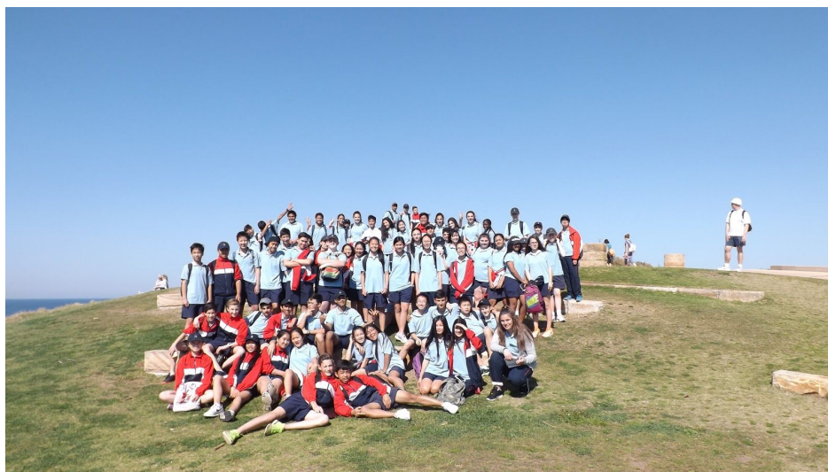
Academic classes 8.1,8.8,8.5 and the Aspect students on Long Reef headland

Hi Trinity, Year 8 want inform you of the great week we had at Regents Park. While Year 12 were getting over their trial exams, Year 11 are getting ready for their end of year exams and year 9 and 10 are doing whatever they do. Year 8 had a great week!