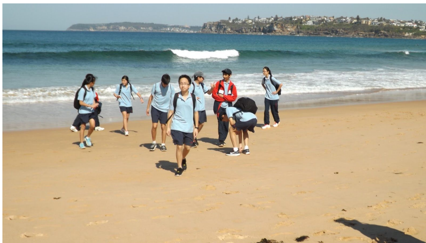
Studying beach erosion, the Trinity way, up close and personal

Monday and Wednesday were the preludes to the highlight of the week, our annual Geography excursion. Once again every Year 8 student, the Aspect class and 15 teachers travelled to Collaroy Beach, to undertake an investigation of coastal processes and beach formation. Superbly lead by our Geography teachers, we learnt about the rivers of sand also known as the beach, sand dunes, rock platforms, where the sand came from and what happens to it after it is eroded away from the beach. The weather was brilliant and Year 8 had another great day of learning, not in a classroom, but outside enjoying each other's company while improving our knowledge of geographical processes and our global environment. It was a great day and a great learning experience. Thank you to the Geography teachers for organising and leading our day!