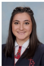
Nellie-Anne Alchikh Credit