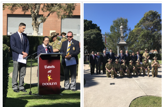
Victory in Pacific Memorial