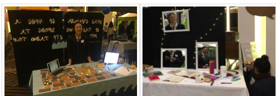
Max Potential Showcase